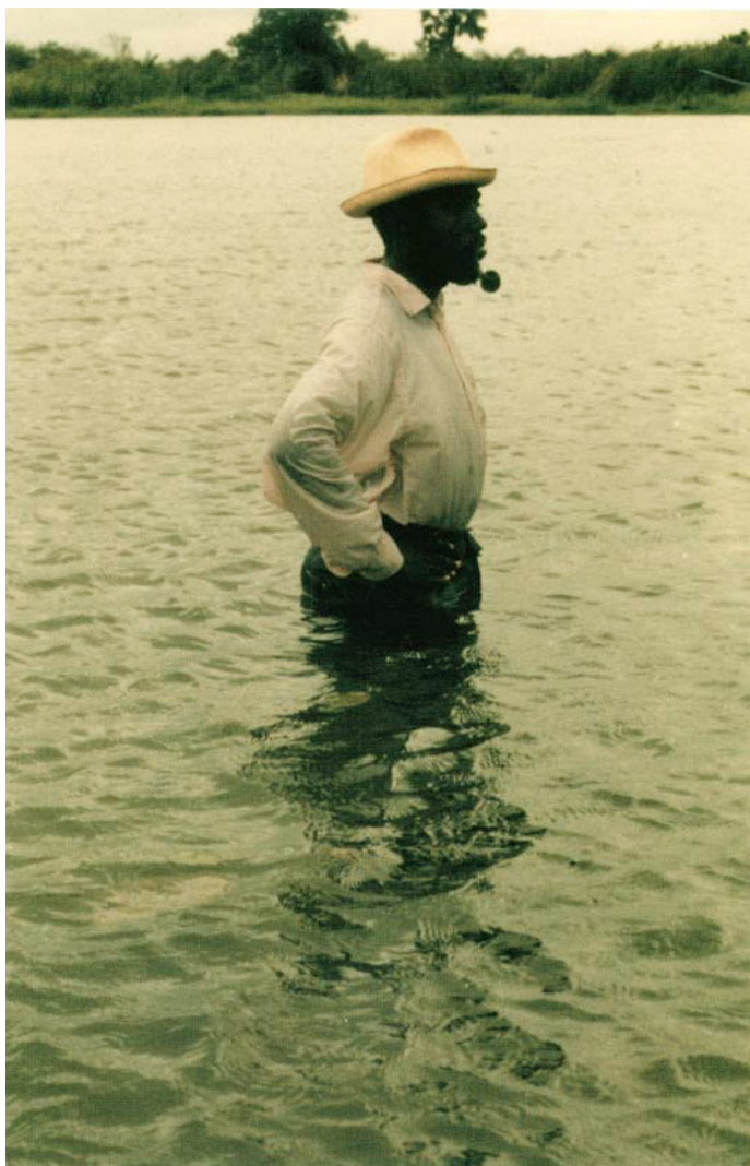
Testament, Man in Water , 1988, BAFC Films

Accordingly, Handsworth's tranquil scene of installation is broached by grinding stabs of inharmonic noise that intrude awkwardly at odds with the formal photographs of couple posed stiffly for a wedding, a boy posing with his Chopper bike, a Union Jack pendant stuck in the handlebars. The image used on the poster for Handsworth Songs is of an ink-blue-tinted archive of a woman, face frozen in blank dejection, pulling a lever on the assembly line. What you hear within the film itself is the woman