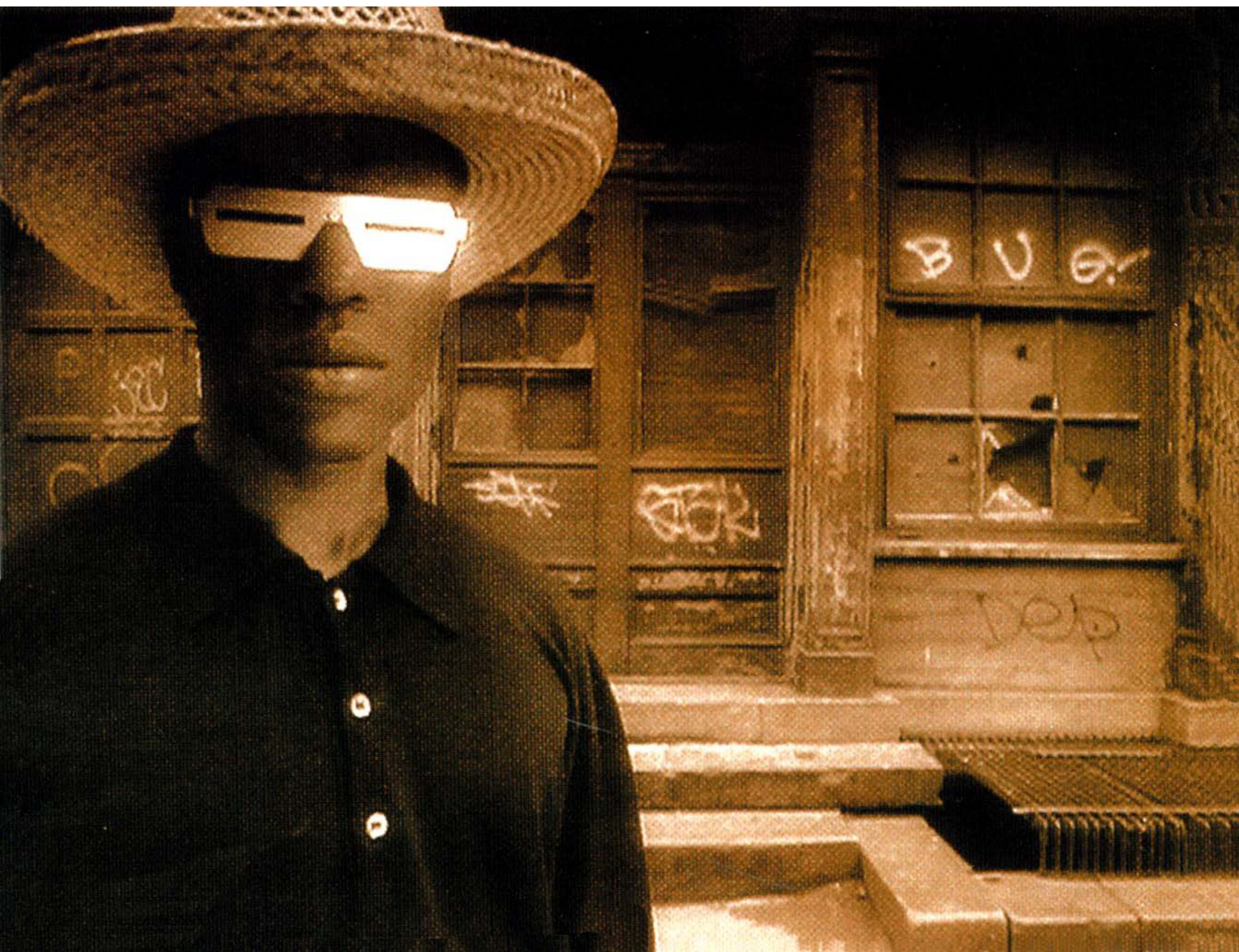
Who needs a Heart , 1995, BAFC Films

ly coherent landscape, the cues from Braxton, Coleman, and Coltrane evoke harmonious discord and tempered dissonance, an era in which beauty and ugliness exist in an incongruous unity. The hushed prayerful vocalisms of Anthony Braxton's (840m) Realise 44m , tint the air with foreboding in Millie's departure from hospital. In the liner notes to his 1968 debut Three Compositions for New Jazz , Braxton wrote "We are on the verge of the fall of Western values." 14