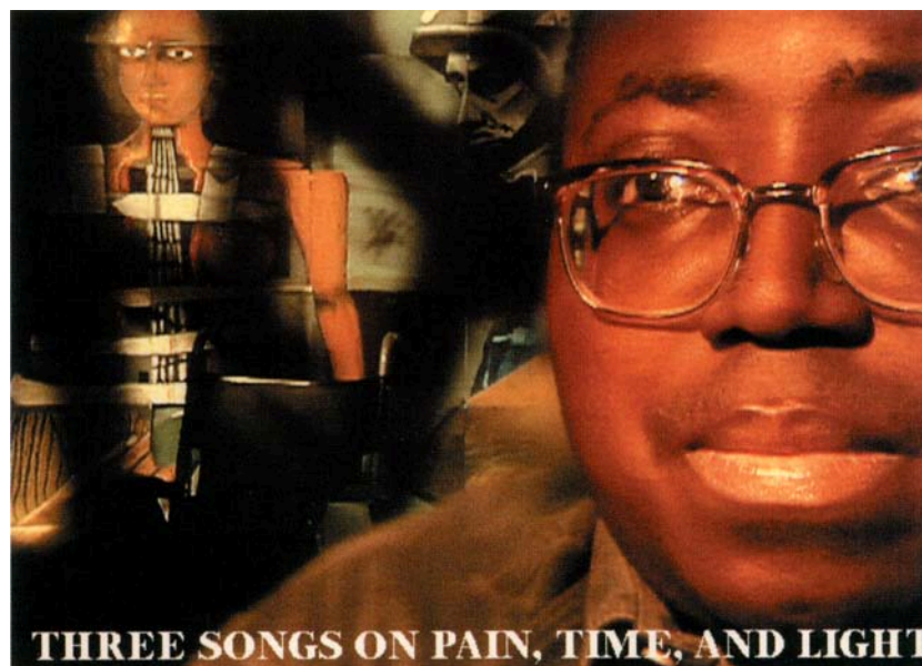
Three Song on Pain, Time and Light , 1996, BAFC Films

The very idea of British Black Power emerges as a pathetic copy of an American model. "So is British Black Power all about going to parties?" a white journalist indignantly demands of Louis, the unstable painter turned militant. It is an amazing moment in which white tradition seeks to defend the seriousness of Black Power from itself and then to separate that politics from its erotic implications. At this point where the erotic, the political, the financial, and the fashionable overlap, left critics tend to defensiveness. The appetite for embarrassment is usually reserved for gloating neocons like Wolfe and V. S. Naipaul. What